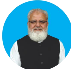
Mr. Liaqat Baloch Member