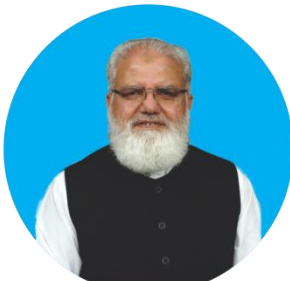
Mr. Liaqat Baloch Member